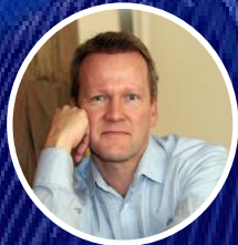
Prof Pasi Sahlberg