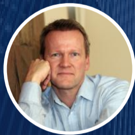
Prof Pasi Sahlberg